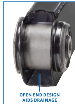
OPEN END DESIGN AIDS DRAINAGE

The MOOG® Problem Solver® CK641180 lower rear control arm is more rugged than the OE design. Its larger box construction provides additional strength and durability. The CK641180 is open on both ends to keep water from becoming trapped in the part, to help eliminate corrosion. In addition, the sway bar bolts directly onto the control arm, preventing issues that a welded bracket can cause.