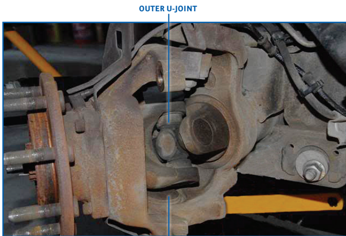
NOTE LIMITED CLEARANCE