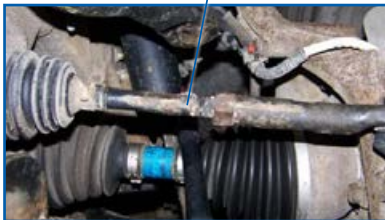
NOTE BROKEN SWAY BAR LINK

The sway bar link on the affected vehicles comes in many styles. Other suppliers may utilize a small-diameter bolt. This small size makes the bolt susceptible to the damaging effects of road shock and corrosion. In addition, the neoprene bushings used in many of these links do not stand up well to stress and weather conditions. Also, other suppliers may use a rolled steel sleeve which can allow contaminants in, leading to corrosion and failure.