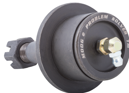
MOOG® BALL JOINTS FOR COMPRESSION-LOADED SUSPENSIONS COME PRE-INSTALLED ON SELECT MOOG PROBLEM SOLVER® CK CONTROL ARMS